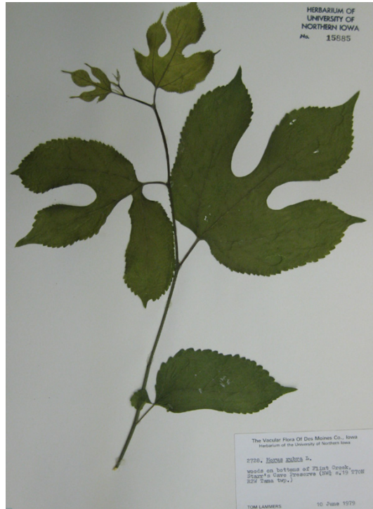
Figure 2. Morus alba specimen. The specimen was previously identified as M. rubra .

After keying out the specimens using a suite of morphological characters (Nepal 2008) and annotating them, we confirmed the occurrence of M. rubra in Iowa, Kansas and Nebraska, but not in Minnesota and South Dakota (Table 2). We confirmed the occurrence of M. rubra in 24 counties of Iowa in contrast to only nine counties listed in the USDA PLANTS database (2012). We also found that earlier identification of the specimens from five of the nine counties was incorrect: Morus specimens from Cass, Hamilton, Harrison, Madison and Pottawattamie County were either M. alba or hybrid individuals. We did not find any herbarium record of M. rubra from South Dakota (SD), and our field exploration of the southeastern SD confirmed the absence of M. rubra from the state. We did not find M. rubra records from as many counties of Kansas where it had been reported earlier. We confirmed the oc-