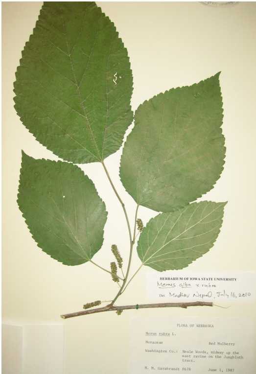
Figure 3. M. alba x rubra specimen. The specimen was previously identified as M. rubra .

currence of M. rubra in 41 counties of Kansas as shown in Table 2. Previously identified specimens from other western and northwestern counties identified as M. rubra were M. alba or hybrid individuals.