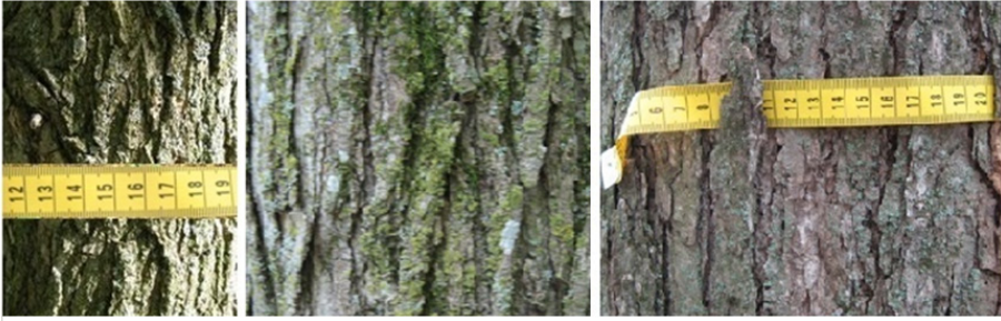
Figure 4. Morphological character of the bark (A = Morus alba , B = hybrid individual and C = M. rubra ).

grayish bark with flattened, thinner ridges that peel back in older trees (Figure 4). M. alba bark forms thick solid ridges that are more of a reddish tan coloration. The branching of a mature M. rubra is widely spaced, and the branches often grow horizontally giving the plant a planar appearance, while in M. alba the branching is more diffused giving the plant a bushy appearance. The two species differ in fruit shape and size: M. rubra has a long cylindrical fruit, while M. alba has an ovoid or ellipsoid fruit. In addition to morphological characteristics, the two species differ in chloroplast trnL-trnF and nuclear ITS DNA sequences. These two gene regions seem promising markers for future projects on assessing the magnitude and direction of introgressive hybridization.