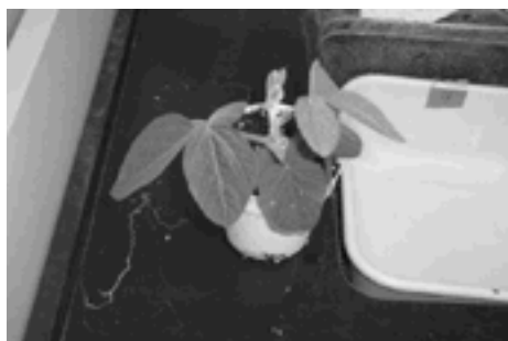
1 HAT - injury severity 2

1 Scale of 1-10 with 10 being dead plants and 1 showing no injury.