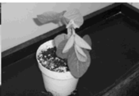
48 HAT – injury severity 3