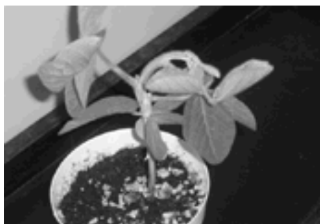
10 DAT – injury severity 8